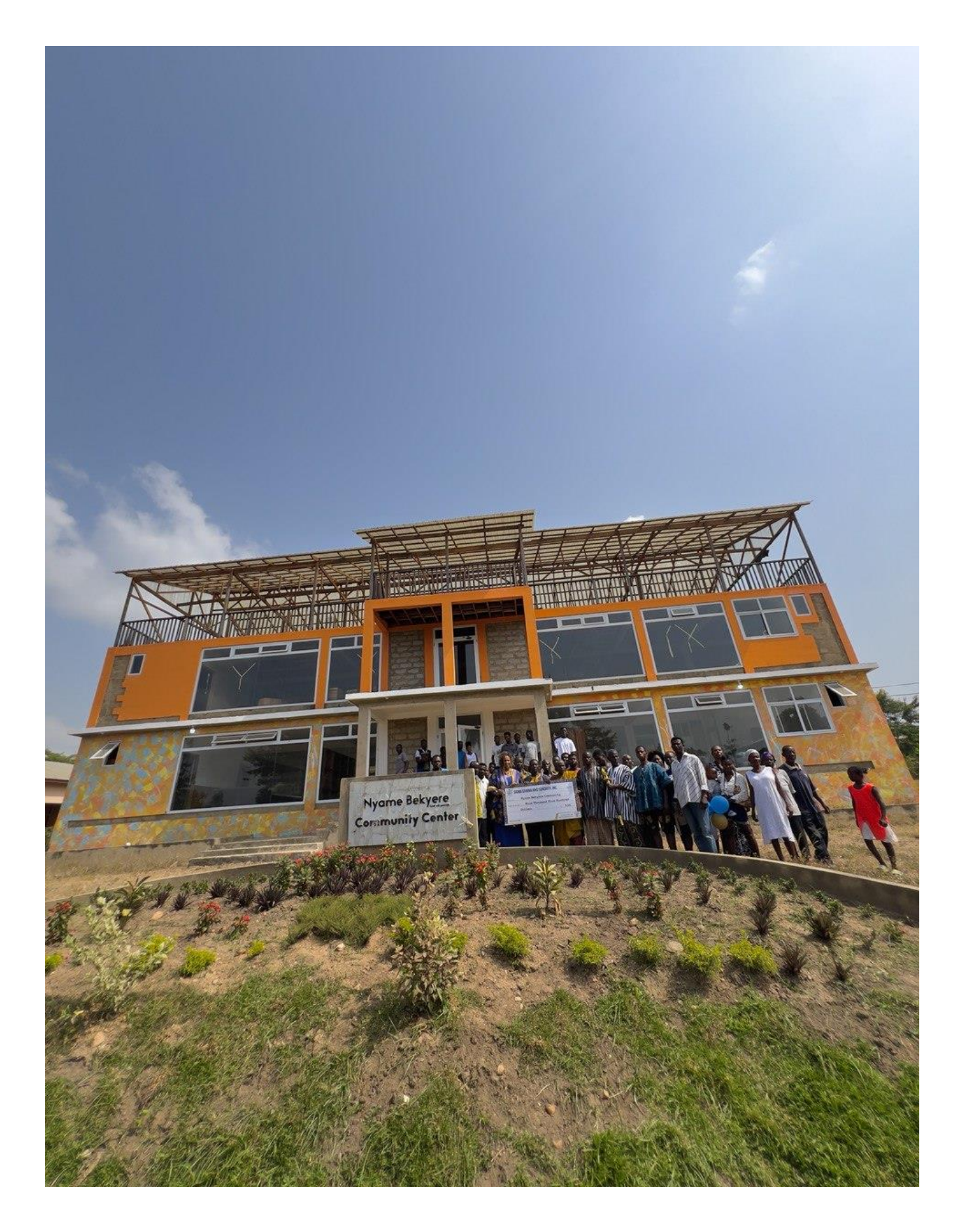
Ny a me bekyere\ Community\ Center-\ Eastern\ Region