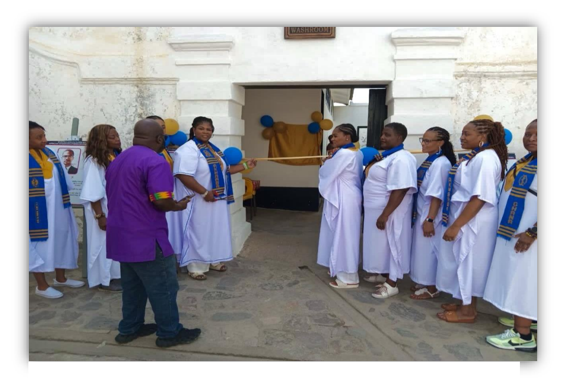
Commissioning Refurbished washrooms at Cape Coast Castle