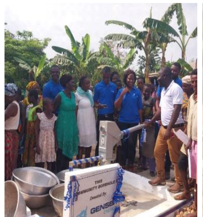
Kokompe- Volta Region