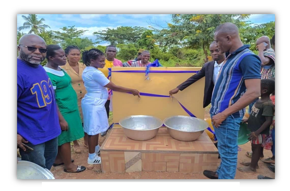
Commissioning of mechanized borehole at Kuntenase.

Another standout achievement in this transformative journey is the refurbishment of critical infrastructure, notably the iconic Cape Coast Castle. As a historical landmark with deep cultural significance, the restoration of Cape Coast Castle stands as a testament to the collective dedication. This refurbishment not only preserves the rich heritage of the region but also enhances the quality of life for the community members and tourists.