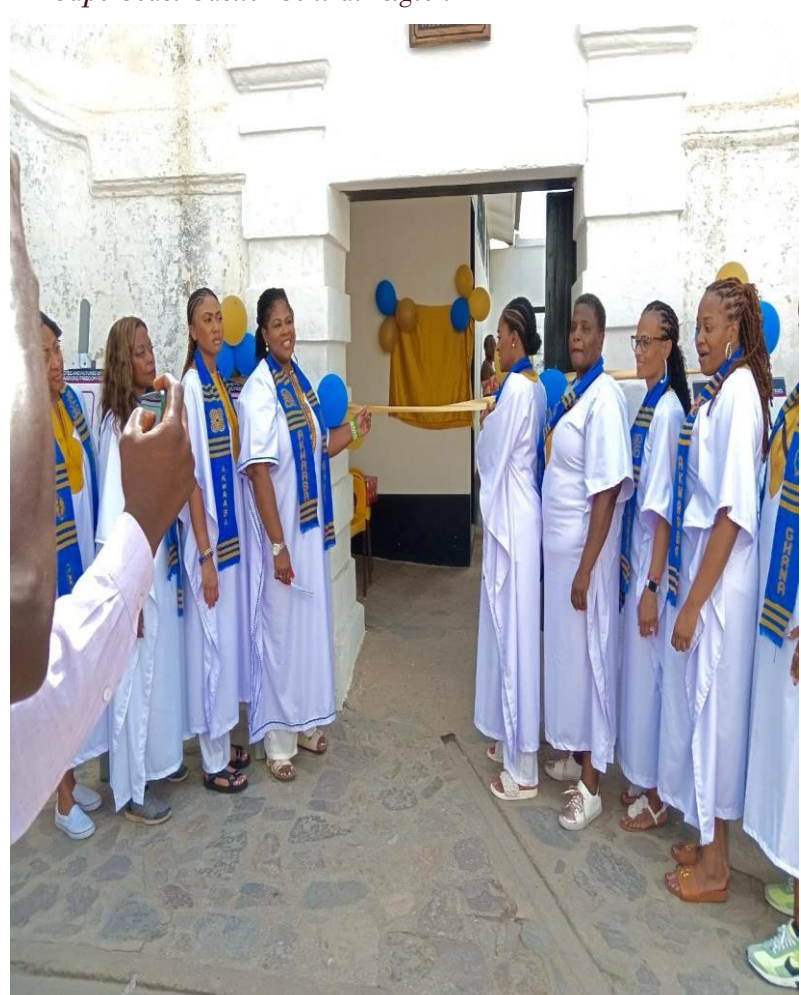
Cape Coast Castle- Central Region