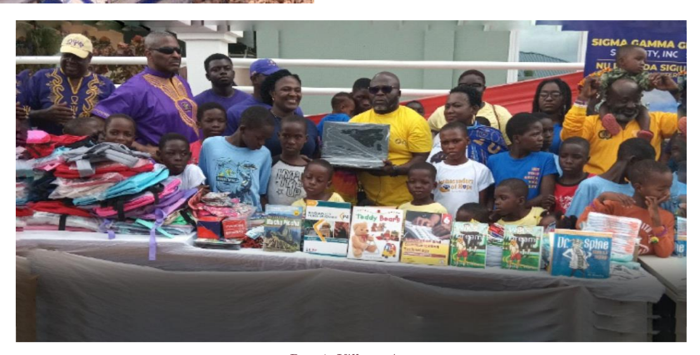
Potter's Village- Accra