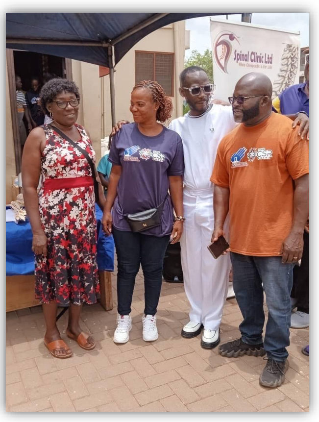
Group Photograph at Potter's Village- Dodowa, Accra