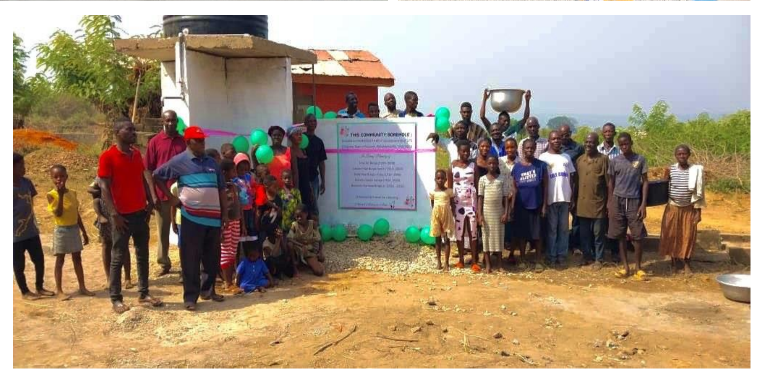
Nkpakadan- Asuogyaman\ District,\ Eastern\ Region